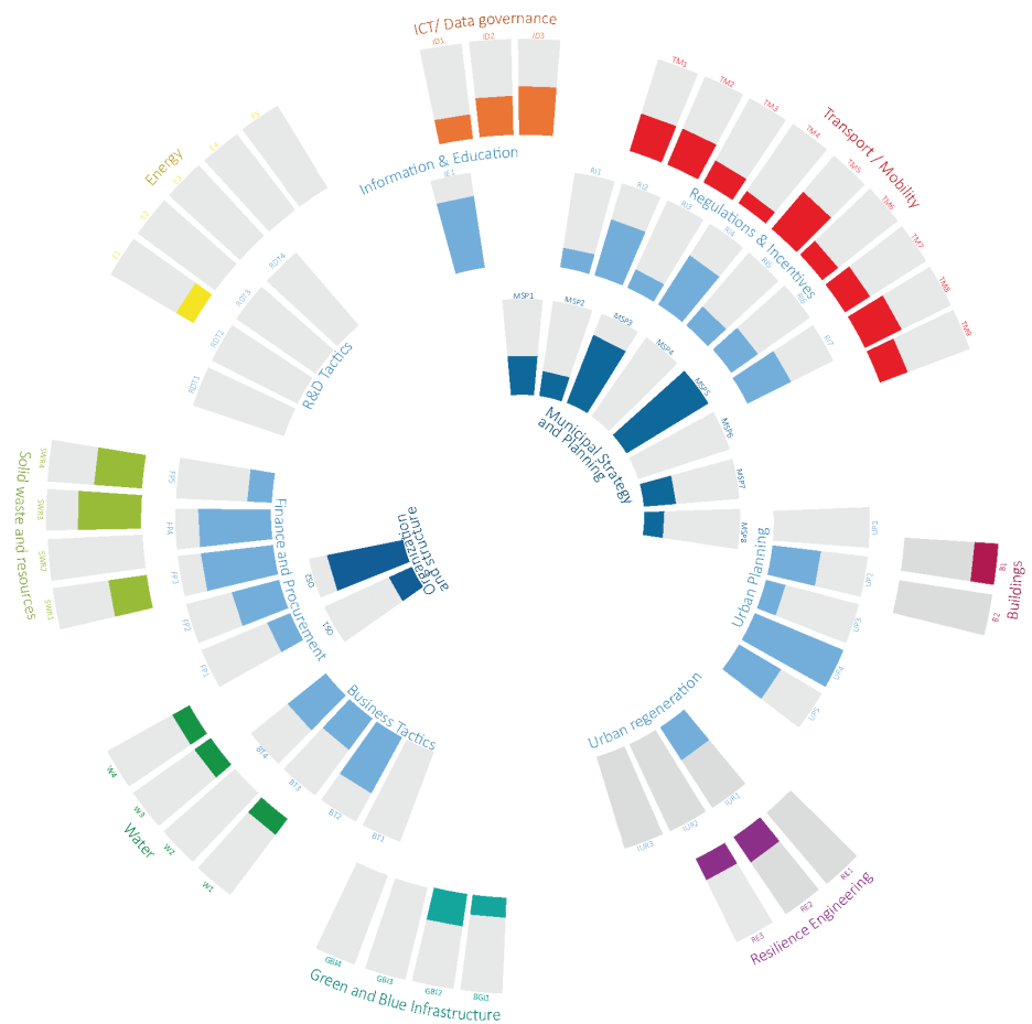
Figure 3: Sustainable Profile of Piura.

Figure 3 illustrates the comprehensive framework applied in Piura and its performance in the different sectors of the city analysed. In a further step, the City Lab Piura is focused on the three sectors of urban planning, energy, and water. The sectors have been selected based on the critical sustainable urban development challenges as well as local stakeholder consultation.