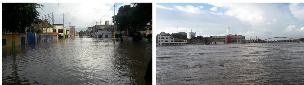
Figure 2: City of Piura during FEN 2017. Source: Own photographs, 2017

against flooding. Moreover, blind water basins cause heavy flooding during the rainy season.