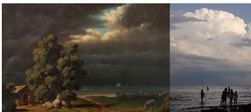
Figure 6. Composition of paint and current photographs of the riverside. Photo collage regarding past representations of inhabiting the riversides and the same recreational practices done today.

The images aim to address the possibility of a future that embraces the environment, reviewing experiences from an amphibious past and sustainable projects from the present.