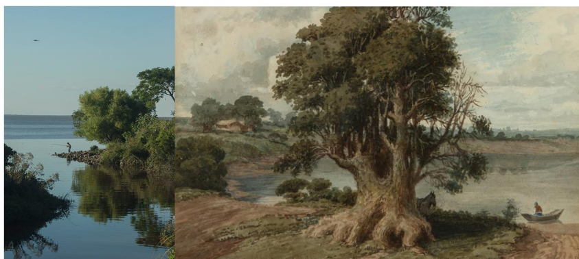
Figure 5. Composition of paint and current photographs of the riverside. Photo collage regarding past representations of a less anthropic landscape and new urban riversides.