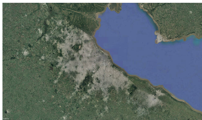
Figure 1. Río de la Plata Basin and Buenos Aires Metropolitan area. The shoreline depicts a diverse and complex ecological and urban landscape.

The accumulation of visual representations from diverse historical moments and its geolocation allows the interpretation of emerging similarities and variations on these complex urban sites. The study of visual documents enhances our capacities to transcend the verbal dichotomies, a product of the translation from visual statements to verbal categories. In order to review the relationship between citizenship and its territory that we must take critical looks at these visual tools to build new dialogues that approach the urban controversies for a sustainable urban practice.