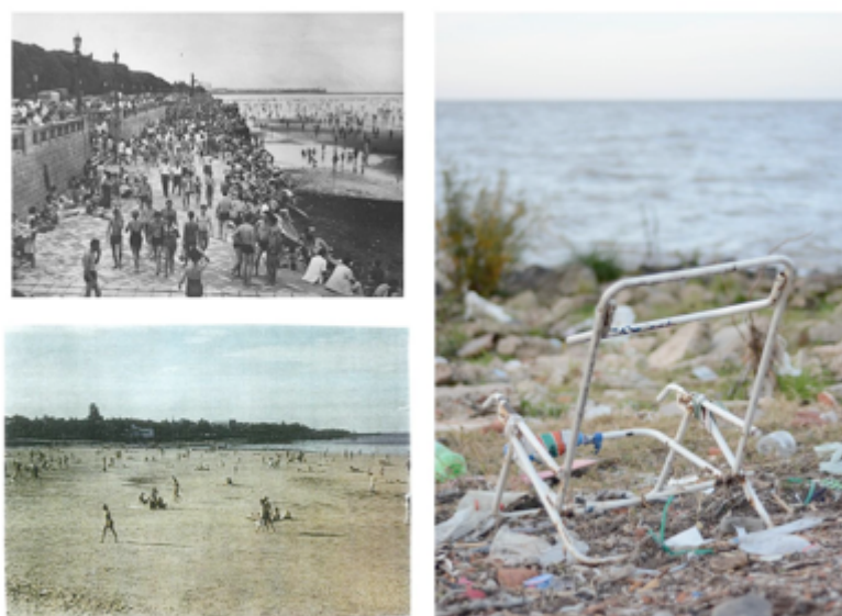
Figure 4. Visual documents representing the transformations of the coastline. From urban baths for recreation to debris and contaminated beaches.

The river beaches from the first half of the 20 th century, bring us closer to an imaginary scenario where the population embraces the principles of the amphibian city by having contact with fresh water from bathing in the ecological heritage. The State's infrastructural works that had been designed for the southern waterfront, inaugurated in 1918 and made the riverside recreation possible for the porteños public. The river was transformed into a popular space for leisure, and it meant the possibility of a coastal landscape accessible to crowds that began to thicken the city. Afterwards, contamination and the discontinuity of policies for maintenance of this type of spaces, deteriorated the promenades and the Río de la Plata began to move away from the community landscapes to become a forgotten border.