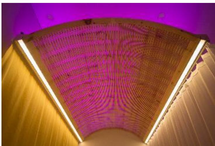
Figure 1. Prototype Modular Cocoon (2012-2014) with a wooden ceiling, biologically effective light (direct and indirect), and different textile layers

For the development of the modular cocoon after quantitative measurements in a ward for psychologically traumatized patients, qualitative interviews were held with therapists, nurses, and patients. In addition, co-designs were performed with patients. After data analysis, the room parameters of light, colours, and textiles were brought into a framework as a basis for a first prototype modular cocoon, which enabled each patient to design his or her own place of retreat. In the testing phase of the prototype modular cocoon in the ward, possibilities for interaction, variations of use, and the modular cocoon's function were studied. These patient tests demonstrated effects such as an increased sense of security, improved sleep quality, and less medication at night.