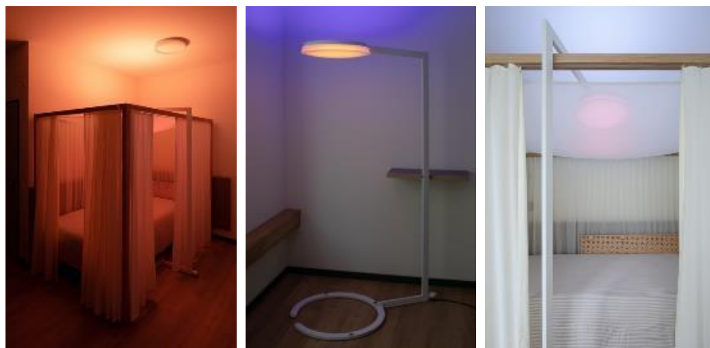
Figure 3. The photographs show three different nature moods: autumn light, warm moonlight, and sunrise, from which the patients can choose.