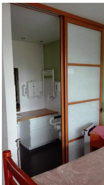
Figure 3. Sliding bathroom door.

In an ideal building, caregivers wish for a small space connected to each private room, to have medical materials right at hand but out of sight. To lift people from their bed or toilet, they prefer using an extra pair of hands rather than mechanical lifting aids. However, the dimensions of the bedrooms or bathrooms sometimes do not allow organizing this smoothly.