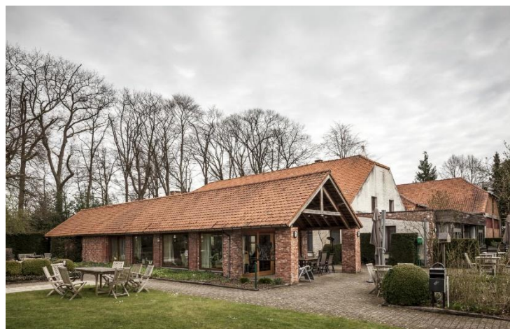
Figure 1. Photo of current hospice; day-care (front) and residential (back) parts.

The old hospice is based in a former farm, surrounded by greenery (Fig. 1 and 2). Patients are addressed as 'guests', a term that fits the ethos of the hospice team and will be used throughout this paper. The residential care part (RC) can accommodate eight guests overnight. The day-care part (DC) welcomes five or six guests per day. These parts are spread over two buildings, positioned a few meters apart (Fig. 2). The inner side of the U-shaped building complex has large windows on all sides. Care is offered by staff and volunteers.