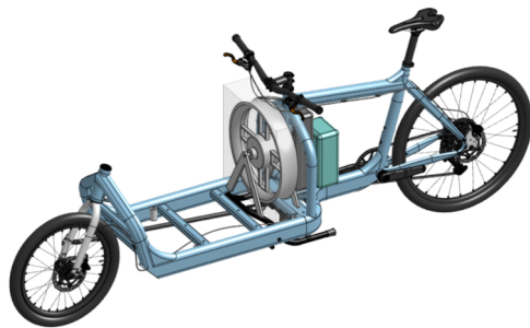
(a) CAD rendering of the envisioned reaction wheel on a common delivery bicycle model.