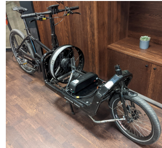
(b) Prototype vehicle with a Bafung motor driven at 48 V with a maximum power of 1500 W and added rim mass to maximize the rotational inertia.