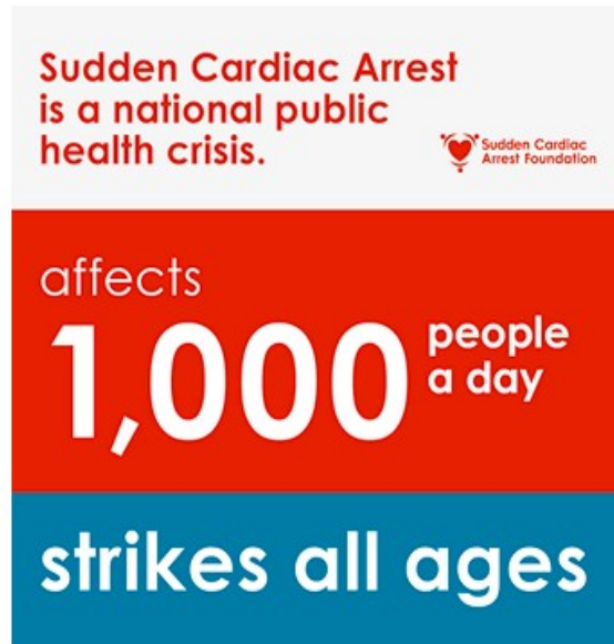
Figure-1: Poster issued by Sudden Cardiac Arrest Foundation on World Heart Day, October 16, 2022 1

As per the update published by the American Health Association in 2022, the number of deaths due to cardiac arrest has increased from 347,322 cases in 2015 to 356,000 cases in 2022 2 . This has made cardiovascular diseases a major fatal disease all across the world ranging from death at home, at public places as well as in hospitals.