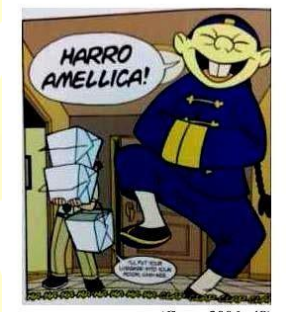
(Gene, 2006: 48)

groups are seen as deviations from this norm. The phrase "fine discriminations" implies that subtle distinctions and judgments are made based on the differences in various human characteristics among different racial and ethnic groups. Essentially, it highlights a system where the standards are biased towards whiteness, leading to the categorization and evaluation of other groups as